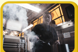
Indigenous Chef Cooks Up Culture