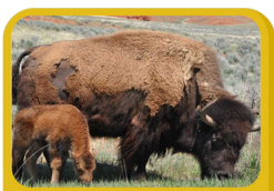
The Bison | America's Sacred Animal

D2.Geo.4.3-5. Explain how culture influences the way people modify and adapt to their environments. W.8